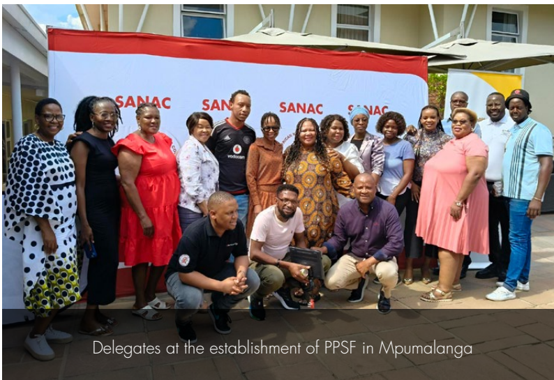
Delegates at the establishment of PPSF in Mpumalanga