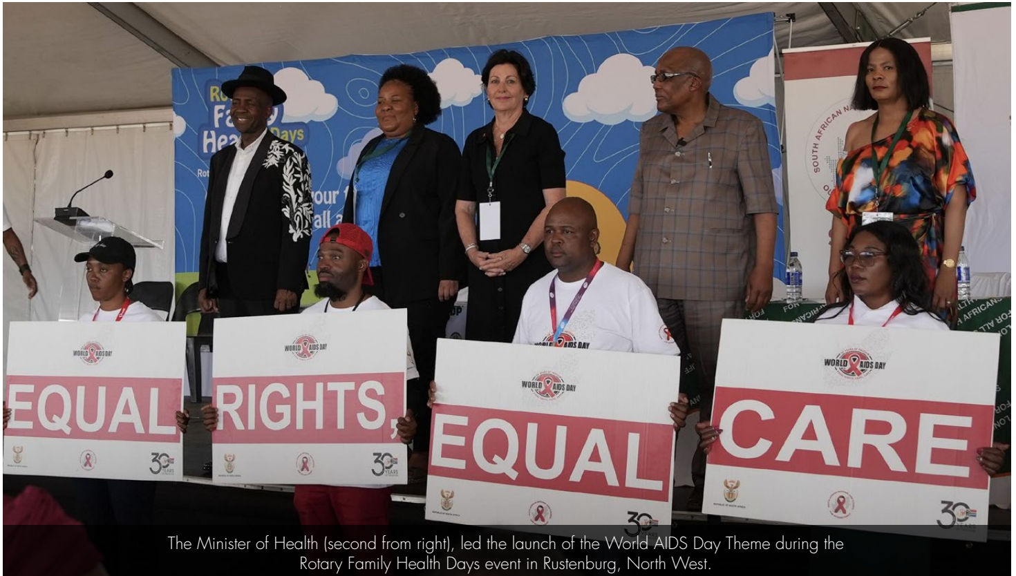
The Minister of Health (second from right), led the launch of the World AIDS Day Theme during the Rotary Family Health Days event in Rustenburg, North West.

On Friday, 14 November 2024, the Minister of Health, Dr Aaron Motsoaledi led the annual Rotary Family Health Days (RFHD) outreach to the peri-mining communities of Rustenburg.