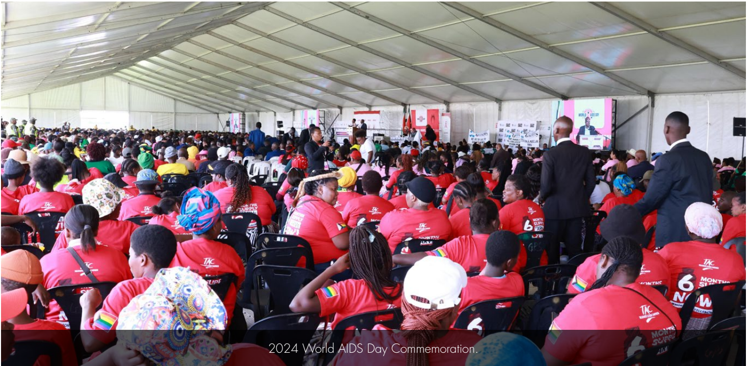
2024 World AIDS Day Commemoration.

The 2024 World Day Commemoration was hosted under the theme, ‘Equal Rights, Equal Care’ , is a call for equal, equitable and dignified access to healthcare for all South Africans regardless of their economic status, gender, race or sexuality. In line with the Global Theme, ‘To Protect Everyone’s Health, Protect Everyone’s Rights’ , South Africa joined the global community in anchoring the World AIDS Day 2024 commemorations, on the protection of everyone’s right to receive universal access to quality health care for all its citizens. This is in line with the principles of the newly enacted National Health Insurance (NHI) model, which is a transformative policy aimed at addressing the inequalities in South Africa’s healthcare system.