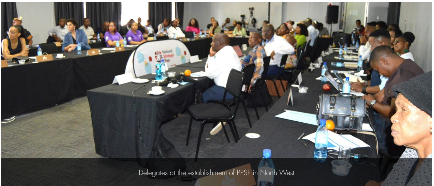
Delegates at the establishment of PPSF in North West