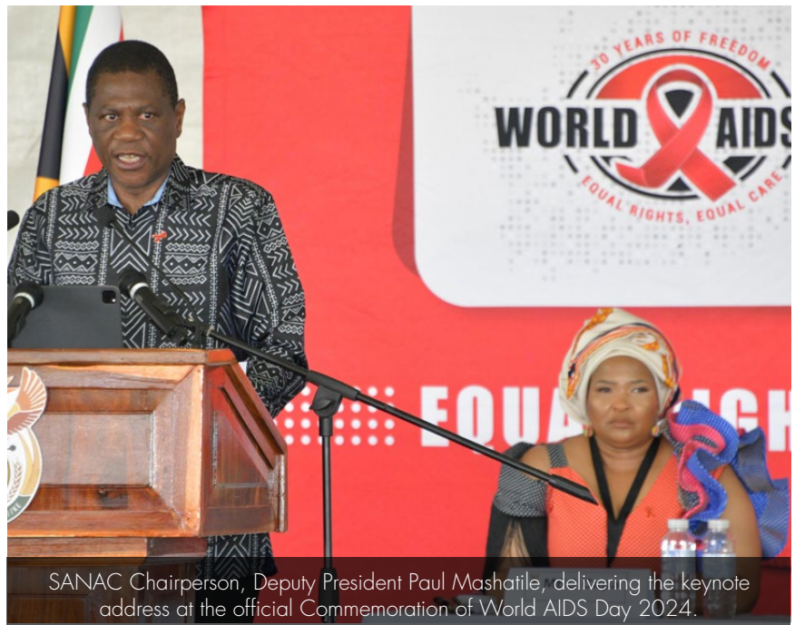
SANAC Chairperson, Deputy President Paul Mashatile, delivering the keynote address at the official Commemoration of World AIDS Day 2024.

On 01 December 2024, Deputy President Paul Mashatile, in his capacity as the Chairperson of the South African National AIDS Council (SANAC), led the official commemoration of World AIDS Day event, at the Sisa Dukashe Stadium, Mdantsane Township, East London, in the Eastern Cape Province.