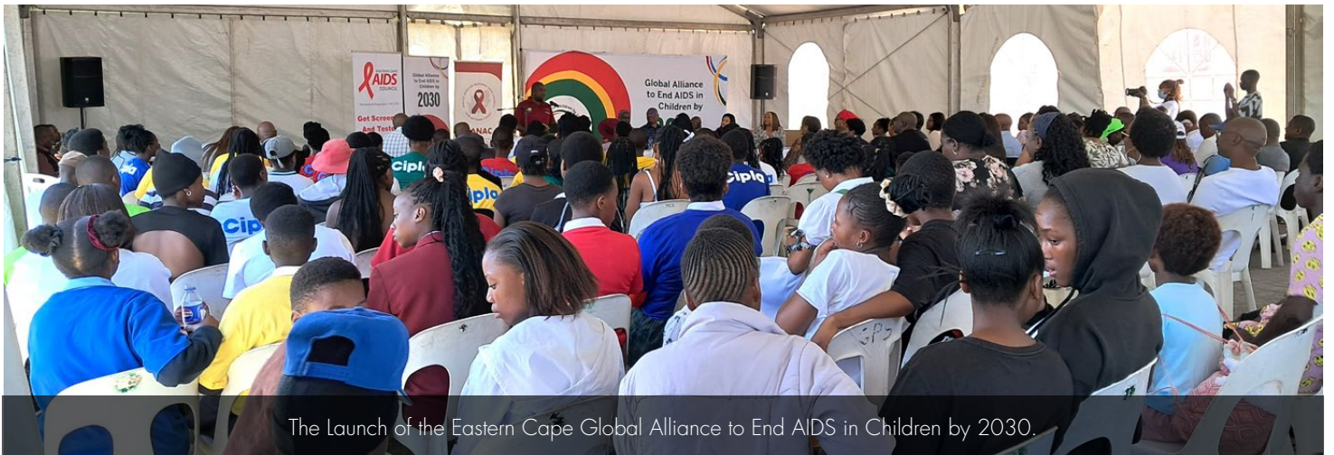
The Launch of the Eastern Cape Global Alliance to End AIDS in Children by 2030.