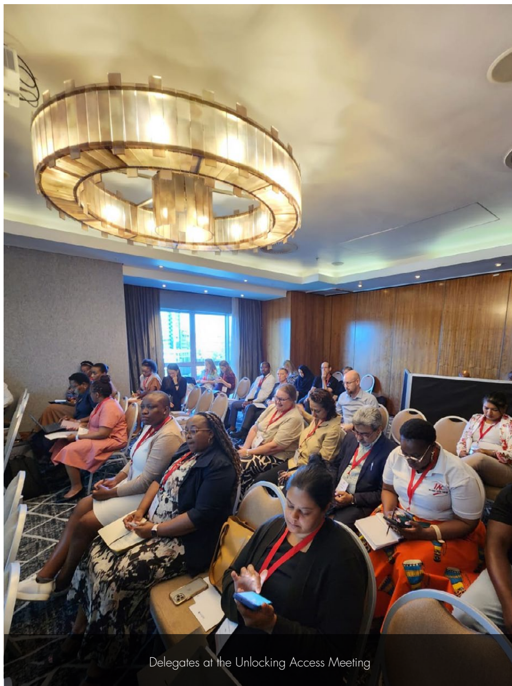
Delegates at the Unlocking Access Meeting

On Thursday, 28 November 2024, the South African National AIDS Council (SANAC) hosted a fundamental meeting titled “Unlocking Access: Overcoming Barriers to Injectable ARVs for All Communities”. Held in Sandton, the event convened key stakeholders from government, civil society, research, academia, and international partners. The meeting featured expert presentations followed by robust discussions on barriers and opportunities of adding injectable ARVs into the country’s HIV prevention and treatment programs.