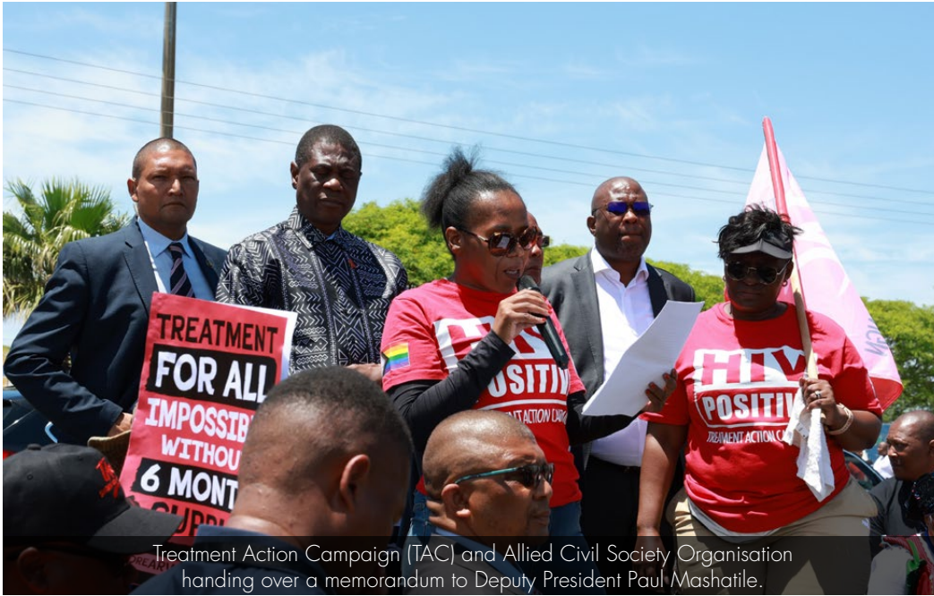
Treatment Action Campaign (TAC) and Allied Civil Society Organisation handing over a memorandum to Deputy President Paul Mashatile.