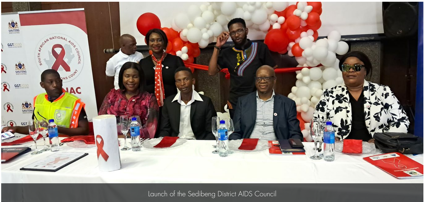
Launch of the Sedibeng District AIDS Council