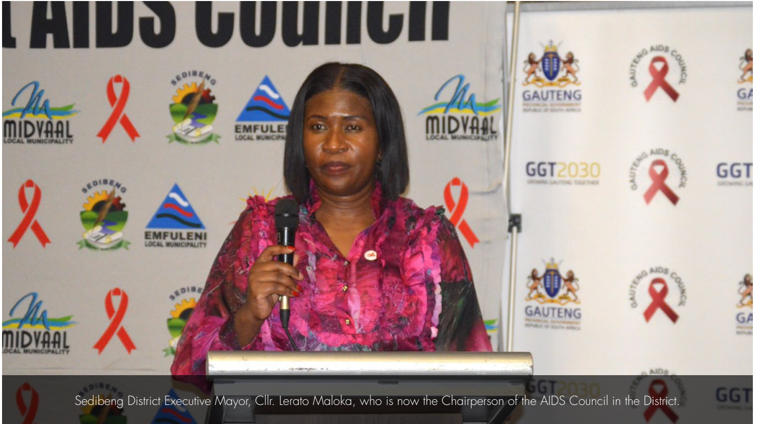
Sedibeng District Executive Mayor, Cllr. Lerato Maloka, who is now the Chairperson of the AIDS Council in the District.

On 11 December 2024, the Gauteng launched the Sedibeng District AIDS Council (DAC) with a strong Civil Society Forum participation leading the way. The launch is intended to bolster the coordination of the HIV, TB, and STIs response in the district, as well as the promotion of public health.