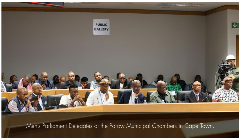
Men’s Parliament Delegates at the Parow Municipal Chambers in Cape Town.

The National Men’s Parliament reaffirmed its dedication to fostering positive masculinity and driving change at all levels of society. By addressing systemic challenges and encouraging open dialogue, it aims to cultivate a culture of accountability and empathy among men. The next National Men’s Parliament is slated for 2026, with ongoing regional engagements to ensure continuous progress and impact.