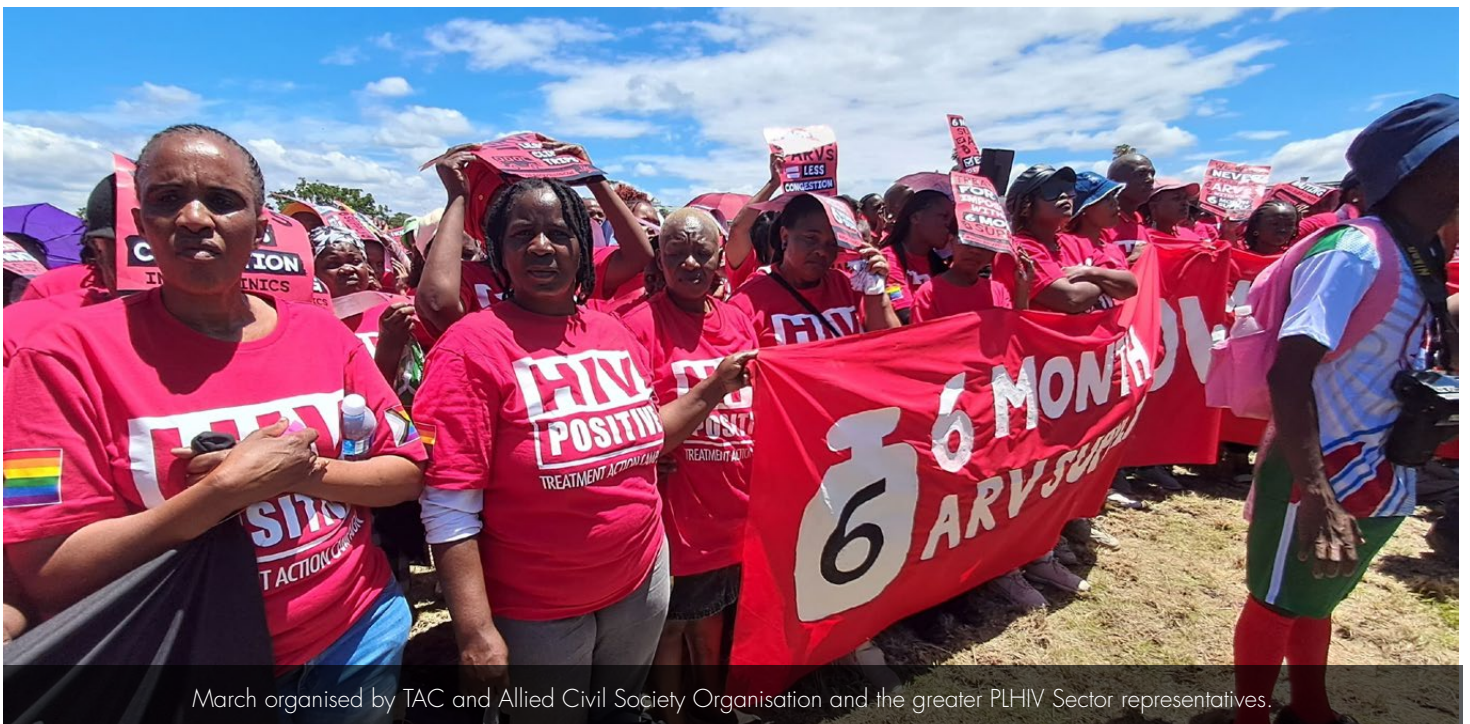
March organised by TAC and Allied Civil Society Organisation and the greater PLHIV Sector representatives.

The memorandum was received by the chairperson of the South African National AIDS Council, Deputy President Paul Mashatile, and the Minister of Health, Aaron Motsoaledi. “More than six million people across Africa are already getting a six-month supply, with good retention and viral suppression outcomes, so why not here in South Africa where we have the biggest HIV burden in the world?” read the memorandum.