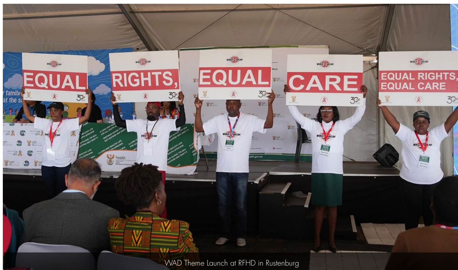
WAD Theme Launch at RFHD in Rustenburg

The minister took an opportunity in his speech to challenge the province and its stakeholders to ensure that friendly healthcare services are provided to communities with a special focus to children, youth and men, so that these 45 000 people are tracked, traced, linked to care and retained in care. That is the only way we can achieve our targets of attaining the 95-95-95 targets, said Dr Motsoaledi.